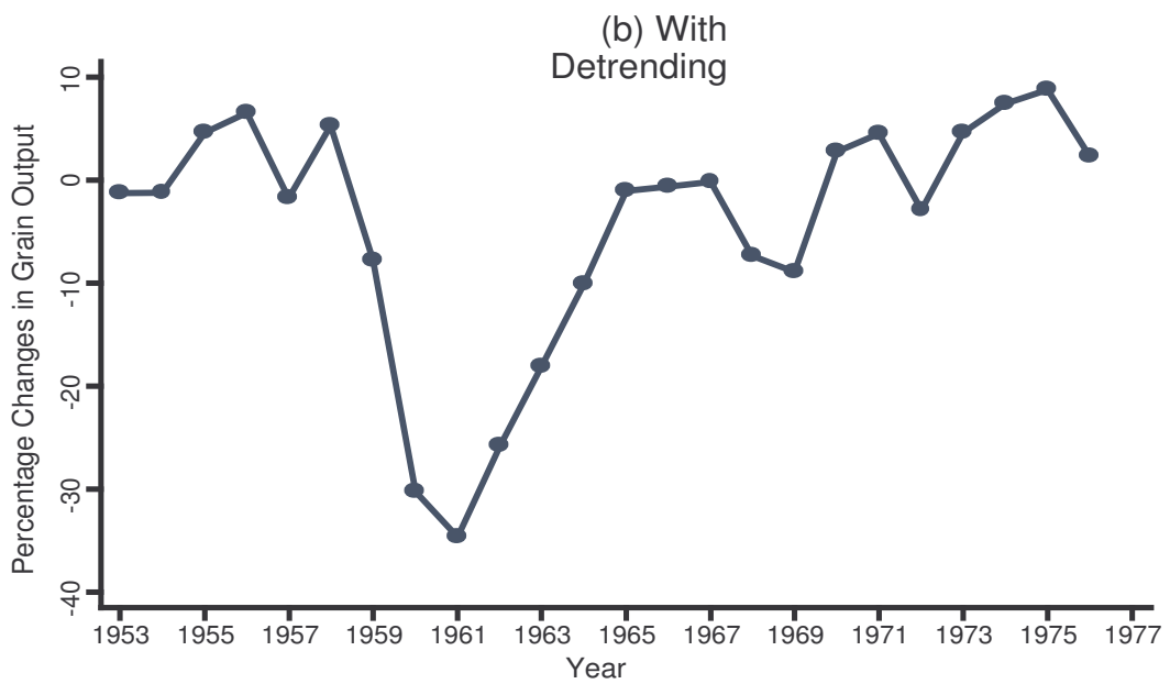
Figure 2: Estimated time effects after controlling for agricultural inputs